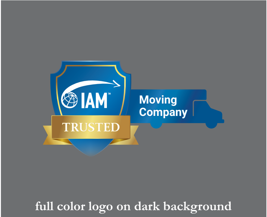
full color logo on dark background