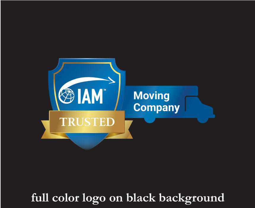
full color logo on black background